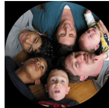
All programs are free!